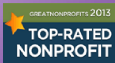
Recognized as a Top-Rated Non-Profit in 2013