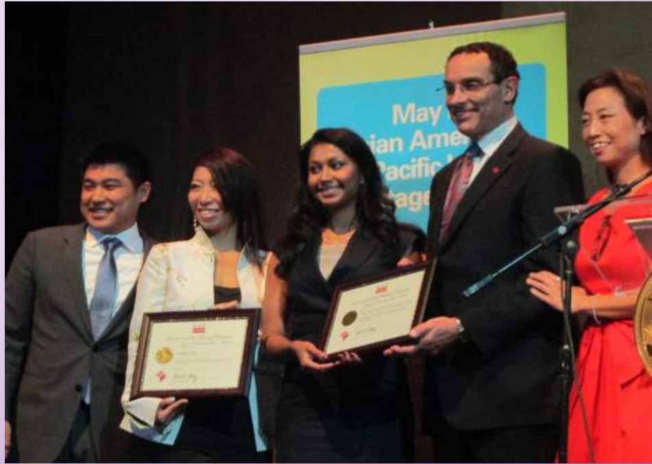
DC Mayor's Community Service Award Recipient